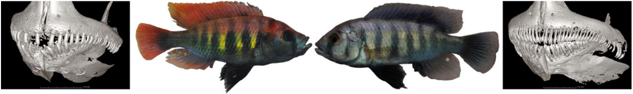
Figure 1. The crossed species. Photos of representative male individuals and CT scan images of the oral jaws of the two parental species used in the experimental cross: Pundamilia sp. 'nyererei-like' from Python Island (left) and Neochromis omnicaeruleus from Makobe Island (right). The N. omnicaeruleus male is the individual used as P in the cross. See electronic supplementary material, figure S1 for photos of representative female individuals and a distribution map. (Online version in colour.)

second-generation hybrids ( F_2 s). We used a N. omnicaeruleus male from our lab population bred from fishes caught at Makobe Island in Lake Victoria in 2010, and a Pundamilia sp. 'nyererei-like' female from our laboratory population bred from fishes caught at Python Island in Lake Victoria in 2003. Two first-generation hybrid ( F_1 ) pairs were then mated repeatedly to generate several clutches of F_2 s over a time of 3 years, resulting in a total number of approximately 213 F_2 s belonging to two full-sib families (150 males, 33 females and approx. 30 juveniles of unknown sex that had died of natural causes in the aquaria and were not used in any analyses). We currently do not know the cause of the distorted sex ratio. The rearing protocol was as described in [47]. All fish were bred and maintained in a large re-circulation aquarium system with a water temperature of 24–26°C and a 12 : 12 h light/dark cycle and fed an ad libitum diet of flake food once a day, white mosquito larvae once a week, and Mysis once a month. All F_2 s were reared to a minimum age of 1 year before further processing.