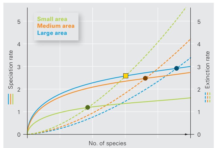
Fig. 2: Dynamics of species diversity in three provinces of different area size. The coloured curves represent speciation and extinction rates in small, medium-sized and large provinces as a function of species diversity. The equilibrium species diversity – where speciation and extinction rates are balanced – is given by the intersection of the respective speciation and extinction curves. In order to predict the influence of a loss of area on species diversity, both speciation and extinction need to be taken into account, as the following example illustrates. Starting from steady-state diversity in a large range (intersection of the blue curves), the new steady-state after a loss of range size – under the erroneous assumption that the speciation rate is unchanged as range size decreases – would be marked by the yellow square. However, as the speciation rate also decreases with range size, the new steady-state is actually established at a much lower level of diversity – namely, at the point where the two green curves intersect (modified from [4]).

Collapse of African cichlid diversity. The cichlids of East Africa's Great Lakes are a classical textbook example of speciation [5]. More than 1000 species are endemic to (i. e. found exclusively in) Lakes Victoria (~ 500), Malawi (~ 500), Tanganyika (~ 200), Edward (~ 60) and Mweru (~ 30). These species evolved within the lakes by many events of ecological speciation in short succession, known as adaptive radiation . Speciation occurred at a rapid pace. For example, 500 species evolved in Lake Victoria over the past 15,000 years – an average of one new species every 30 years. This was made possible by ecologically heterogeneous habitats and historically large population sizes. Although the total cichlid population of Lake Victoria is split up into more than 500 different species, each individual species shows considerable genetic variation, indicating that large populations existed over long periods, with occasional exchange of genes between species. Large standing genetic variation is a prerequisite for rapid speciation