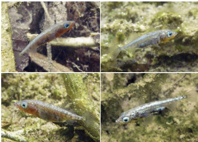
Fig. 1: The three-spined stickleback – an example of new diversity arising locally over a period of a few decades. Left: a larger form with red breeding coloration, which breeds in the littoral zone of a small lake and is similar to sticklebacks in the surrounding waters. Right: a smaller, endemic form with yellowish-orange breeding coloration, which inhabits the sediment in the pelagic zone of the same lake. Our genetic data suggest that the yellow form arose locally from the red form within the last 50 years.

Speciation can be fast. Two very different interest groups are particularly concerned with changes in biodiversity – conservation ecologists and environmental organizations on the one hand,